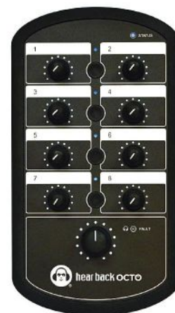
The OCTO Mixer has easy-to-use controls and a mic stand mount for convenience.

Set up was quick and easy. Using the DB25-to-TRS cable, I connected channels 1 and 2 to a stereo aux send on my console (overall band mix) and patched channels 3-6 into the direct out connectors on each of my vocal channels. I ran a Cat-5e cable from the Hub to each OCTO Mixer.