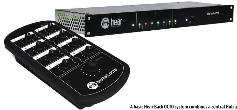
A basic Hear Back OCTO system combines a central Hub and one to eight OCTO Mixer controllers.

The Hub accepts analog audio signals via a DB25 connector (wired in the TASCAM DA-88 analog standard), an optical port (ADAT lightpipe) or the HearBus Port. A front panel switch on the